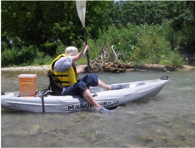
Figure 2 this young lady knows the proper way to kayak, but kept us in stitches demonstrating how those without training kayak.